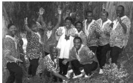
“Ladysmith Black Mambazo”

Westernization of South Africa by missionaries and the establishment of apartheid directly affected the music of the Zulu people. In the late 1800s black American minstrel groups, known as jubilee singers , toured South Africa inspiring the formation of competitive clubs among the migrant workers or miners whose male choral singing became known as Isicathamiya or dancing on their toes. Because Isicathamiya has its roots in the mining camps that separated men from their families, these choral groups were exclusively comprised of men.